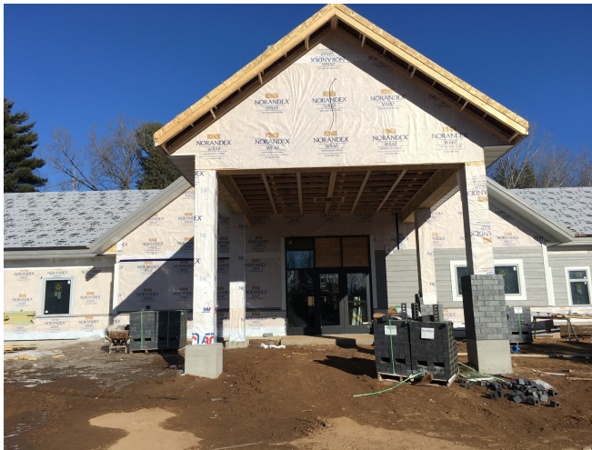
Our new front door!