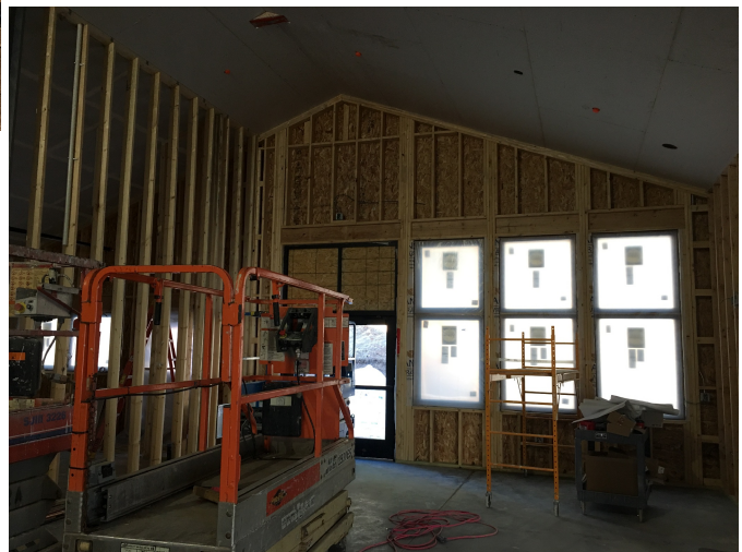
Windows overlooking the back patio.