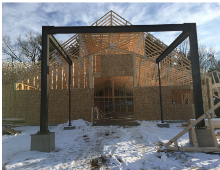
View of the front door from outside.