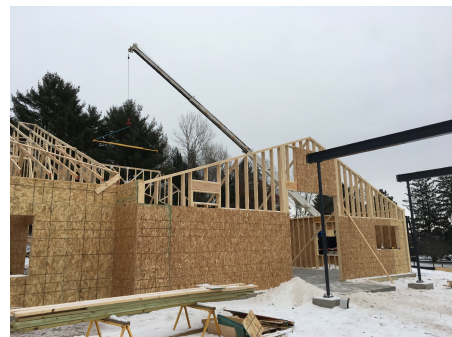
The front of the building