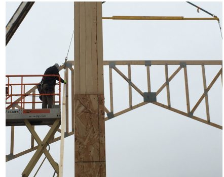
The roof takes shape.