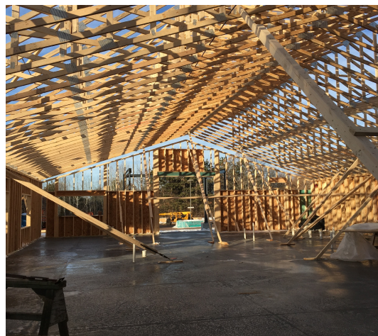
View of the front door from inside.